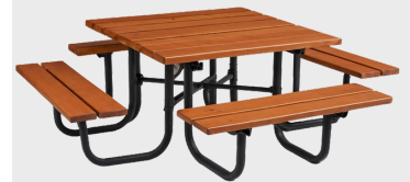
Square Table Available in 4' 8 legs