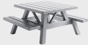
Perennial Table Available 4', 6', or 8' 2 legs