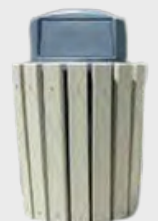
Trash Can Frame Anchor kit available 32 Gallon Capacity