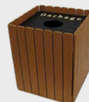
Arbor Receptacle 5" or 8" Opening 32-44 Gallon Capacity