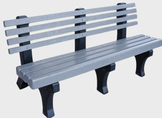
Designer Bench Available in 4', 6', or 8' 2-4 legs