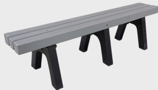
Sports Bench Available in 4', 6', 8', 12' 2-4 legs