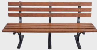
Garden Bench Available in 4', 6', or 8' 2-4 legs