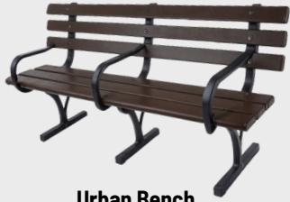
Urban Bench Available in 6' or 8' 3-4 legs

Lumberock Artisan Benches are designed for those who lead an active lifestyle and appreciate both performance and style. Crafted from ultra-durable, low-maintenance composite lumber, these benches are perfect for athletic facilities, outdoor training spaces, parks, and commercial properties. Available with all-plastic construction or powder-coated steel legs, they resist moisture, mildew, and splintering—ensuring a comfortable and reliable place to rest after any adventure or workout.