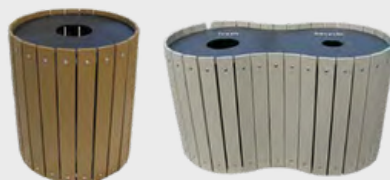
Barrel Bin Single or Double 32-44 Gallon Capacity