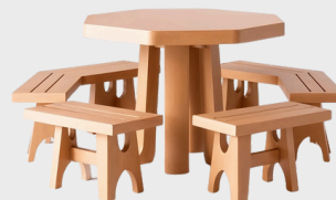
Hexagonal Table Available in 6' 9 legs