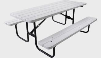
Standard Table Available in 4', 6', 8', 12' 2-5 legs