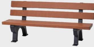
Trailside Bench Available in 4', 6', or 8' 2-4 legs