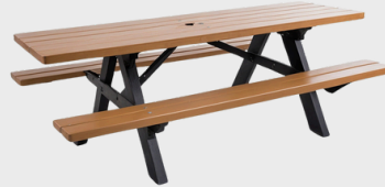
Picnic Table Available in 6', or 8' 2-3 legs