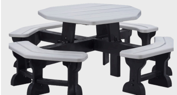
Courtyard Table Available in 8' 8 legs